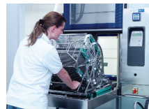
Packaging | Sterilisation

Plastic injection moulding parts (technical, medical or implants) from the idea to its implementation.