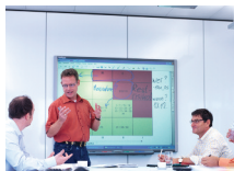
Risk | Quality mgmt.