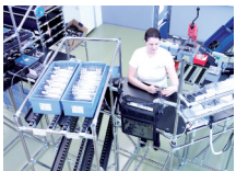
Project mgmt. | Lean | 5S